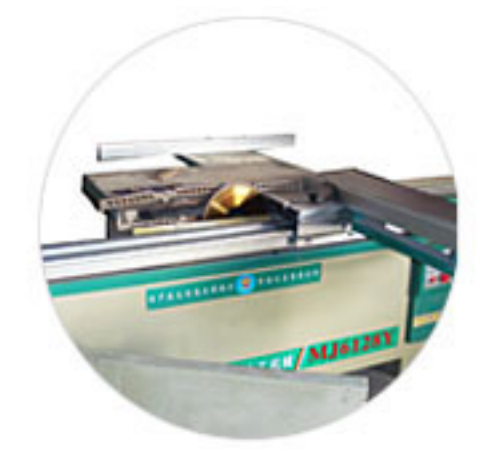
Wood saw right angle